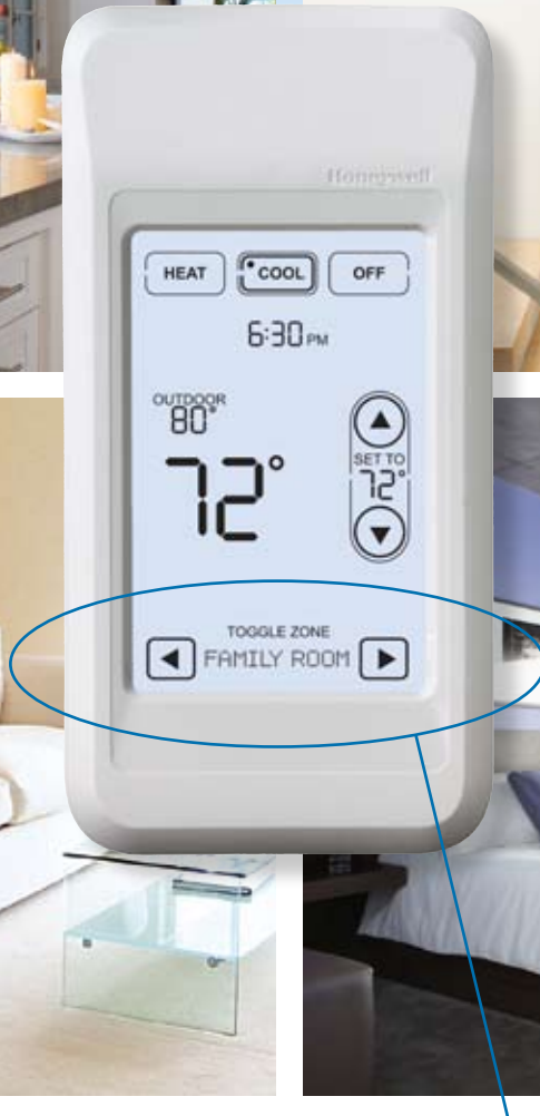
Toggle between zones to set the temperature in any zone from anywhere in the home