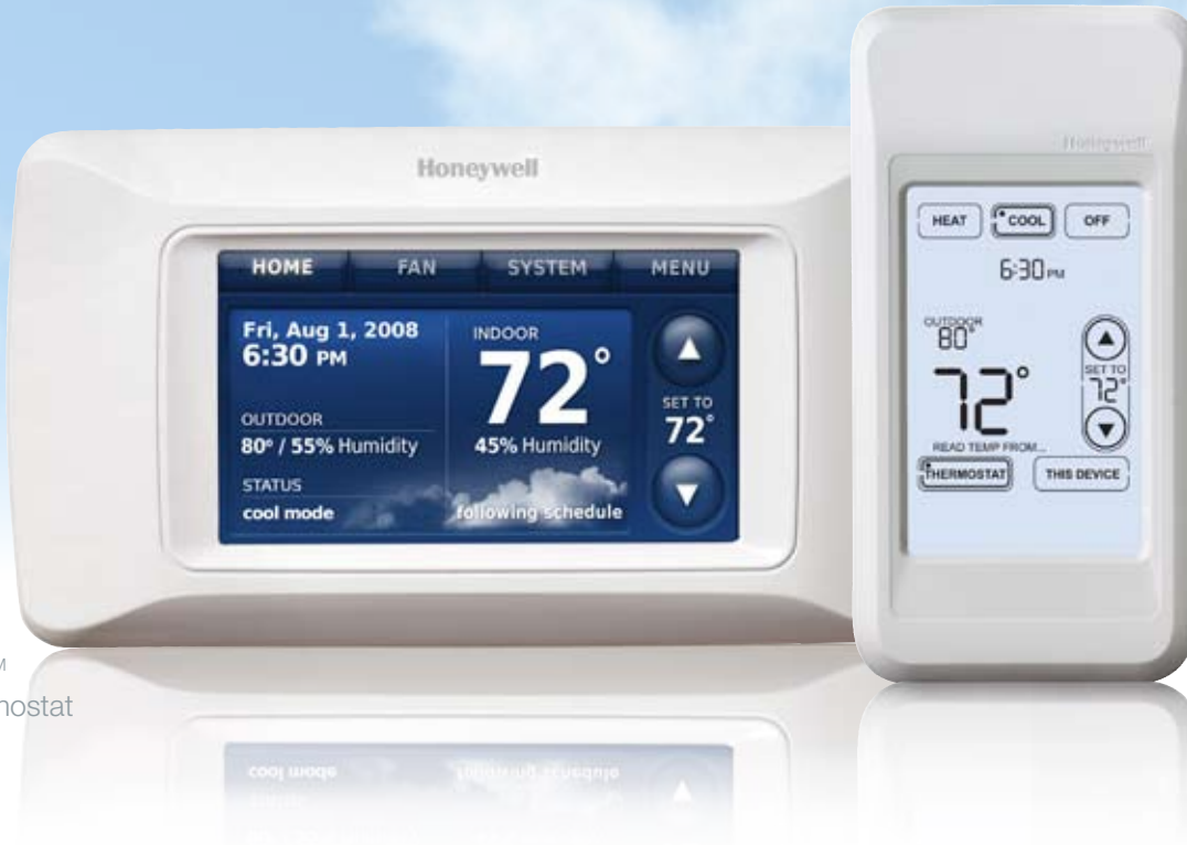
Prestige™ HD Thermostat